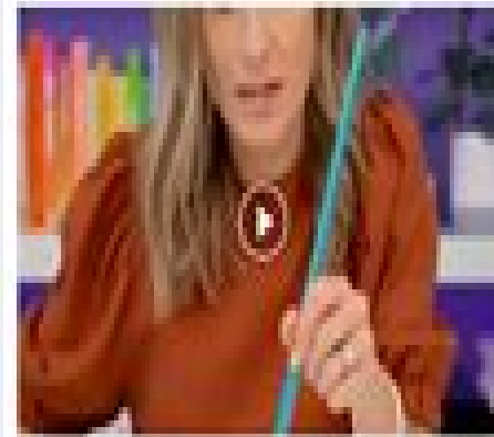
Grief Circle Painting