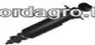
Shock Absorber Rear