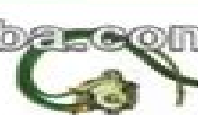
Oil Pump Assembly