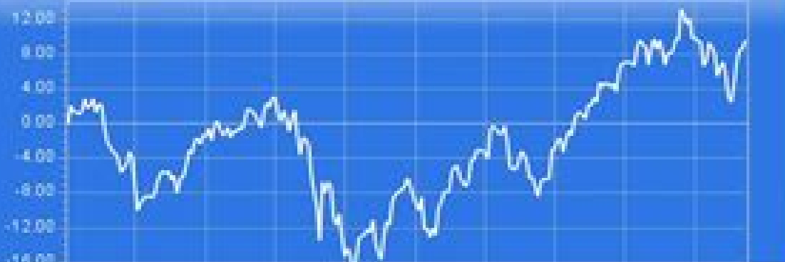
Portfolio YTD Cumulative Return (%)

Portfolio Scope Net TS Rate Period Cumulative Frequency Daily