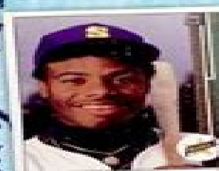
Ken Griffey Jr.