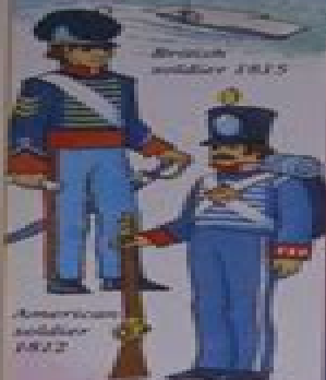
British soldier 1815