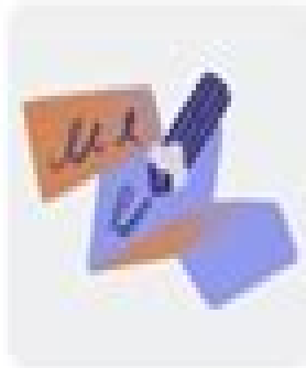
Subject line & preheader generator