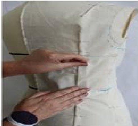
Fig. 5.10 Pinning seams and darts together on longline bodice; the pins go in and out through all the fabric layers and the stand cover.