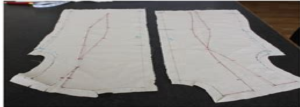
Fig. 5.12 Completed draps for longline bodice on the flat.