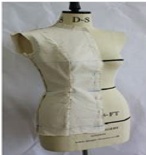
Fig. 5.11 Completed drape for a longline bodice on the mannequin.