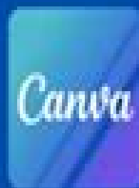
CANVA – GENERATING CONTENT