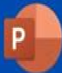
POWERPOINT SPEAKER COACH