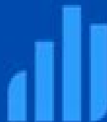
GRADESCOPE – GRADING