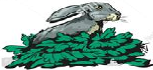
Digestive system in herbivores