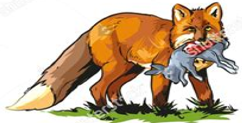
Digestive system in carnivours