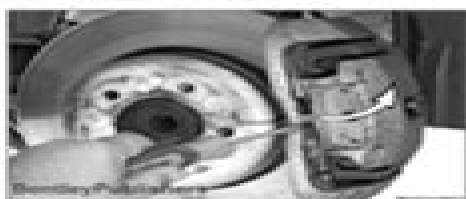
Detailed brake pad and rotor service. 340 Brakes