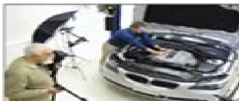
Bentley technical editors removing motor cover on V8 (N62) engine.

The do-it-yourself BMW owner will find this manual indispensable as a source of detailed maintenance and repair information. Even if you have no intention of working on your vehicle, you will find that reading and owning this manual makes it possible to discuss repairs more intelligently with a professional technician.