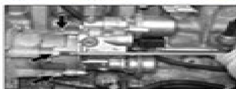
Servicing the high-pressure fuel system on turbo models, including replacing N57 fuel pump. 160 Fuel Tank and Fuel Pump