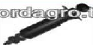
Shock Absorber Rear