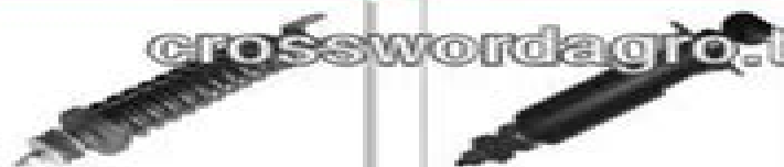
Shock Absorber Front