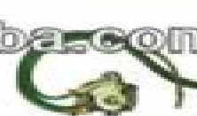
Oil Pump Assembly