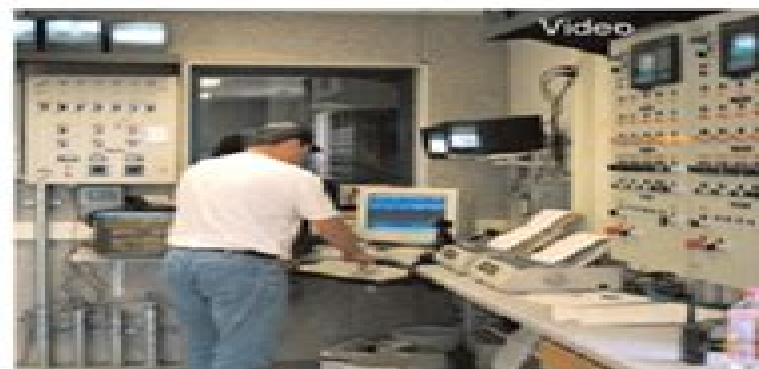
Fig. 10-1. Control room for batching equipment in a typical ready mixed concrete plant. (69894)

Liquid chemical admixtures should be charged into the mixture as aqueous solutions. The volume of liquid, if significant, should be subtracted from the batched quantity of mixing water. Admixtures that cannot be added in solution can be either batched by mass or volume as directed by the manufacturer. Admixture dispensers should be checked frequently since errors in dispensing admixtures, particularly overdoses, can lead to serious problems in both fresh and hardened concrete.