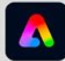
Adobe Express & Firefly