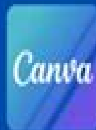
CANVA – GENERATING CONTENT