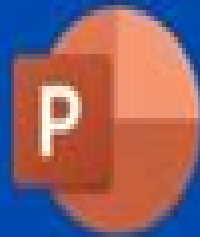
POWERPOINT SPEAKER COACH