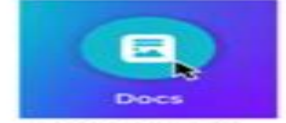
Canva Magic Write