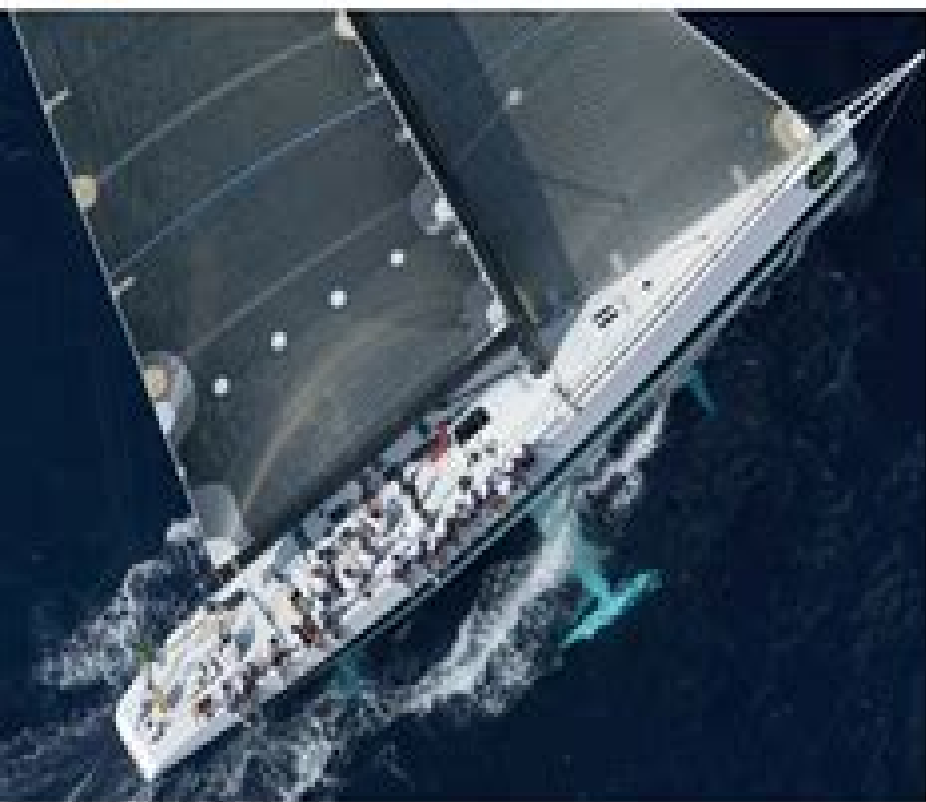
Fig. 1.14 A yacht under way

Fig. 1.13 shows a yacht sailing at constant speed in calm water.