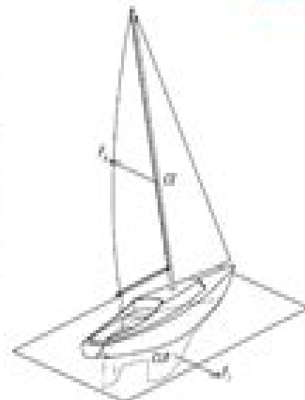
Fig. 1.4 The forces between the forces developed in the air and in the water

Let's start by studying what happens between the yacht and the air surrounding her. The action of the apparent wind V_a on all parts of the boat above the waterline (deck, rigging and sails) through the basic mechanisms described in Appendix 1 that