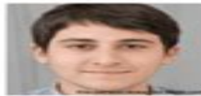
Random Face Generator