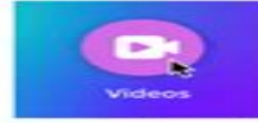
Canva Bkgnd. Remover