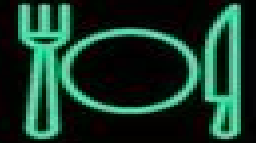
TIFFIN & FOOD SEVICES