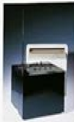
Marcello Neri's portable radio type 1212, 1962