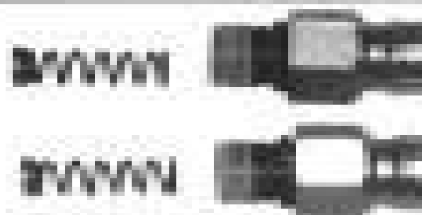
Fig. 2: Piston and connecting rod assembly