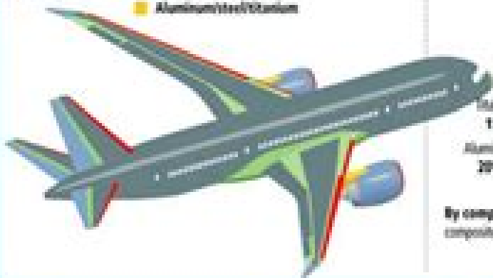
Total materials used By weight