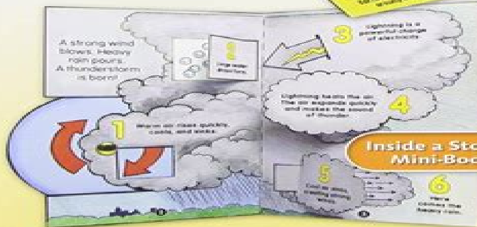
Inside a Storm Mini-Book