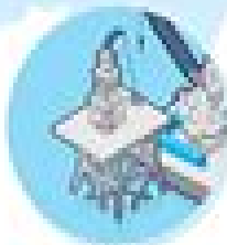
CTU Coiled Tubing Unit

* Well service equipment up to 160 mT • Setup can be used with any type of crane