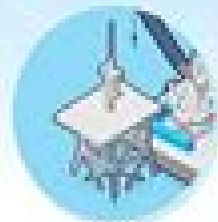
HWO Hydraulic Workover Unit