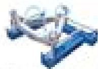
3D motion compensated platform BM-T700