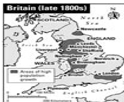
Growth of British Cities 1750–1881