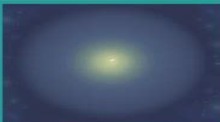
Figure 1.10 Model of a chemical reaction. The reaction is shown as a glowing point of light, surrounded by a faint, circular glow. This represents the energy changes that occur during a chemical reaction. The glowing point of light is the reaction site, and the surrounding glow is the energy released or absorbed during the reaction. The reaction is shown as a glowing point of light, surrounded by a faint, circular glow. This represents the energy changes that occur during a chemical reaction. The glowing point of light is the reaction site, and the surrounding glow is the energy released or absorbed during the reaction.

A ChemQuandary is a puzzling chemistry-related question or situation that is designed to stimulate thinking and decision making. It can be used as a think-pair-share, to begin a discussion, or as a prompt for a journal entry.