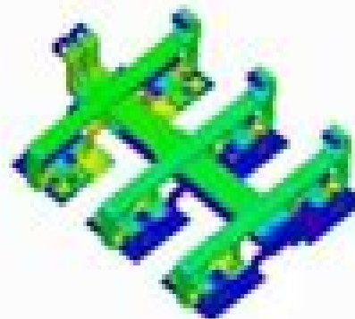
Loss in Q3D