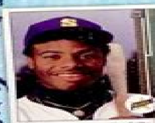
Ken Griffey Jr.