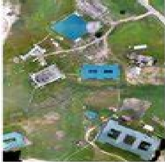
Figure 1 Aerial photograph of the study area