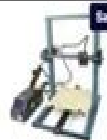
Creality3D CR - 10 $369.99 3D Printer