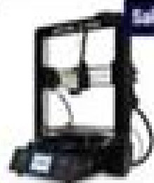
Anycubic I3 $309.99 MEGA Full Metal