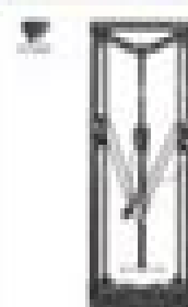
Anycubic Koss $169.99 Upgrd Pulley Versio Unfinished 3D F - WITH PRIN MATERIAL BRACKET BLA