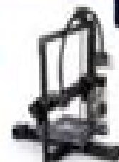
Tevo Tarantula $175.99 3D Printer