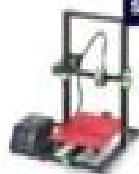
TEVO Tornado $359.99 Most Assembled Full Aluminum Frame 3D