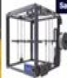
Tronxy X5S $319.99 High-precision Assembly Metal Frame 3D Printer -