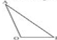
diagram not to scale