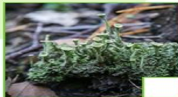
"Trametes fimbriata (Cladonia fimbriata)"