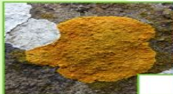
"Caloplaca flavescens" by David Beckett is licensed under CC BY 2.0