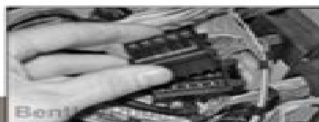
Extensive electrical component location information. 801 Electrical Component Locations