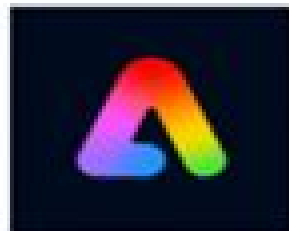
Adobe Bkgrnd. Remove