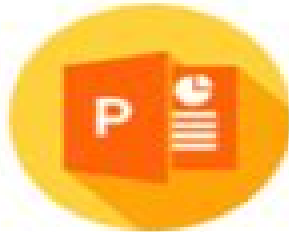
PowerPoint Spkr. Coach