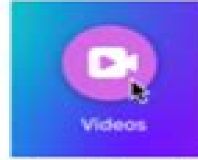
Canva Bkgrnd. Remover