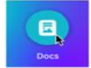
Canva Magic Write