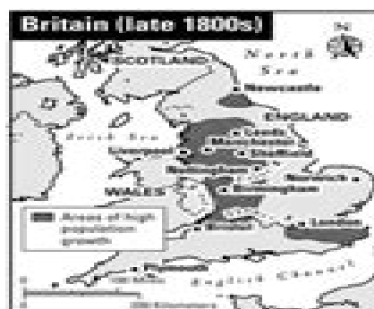
Growth of British Cities 1750–1881