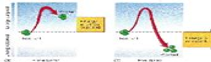
Energy in chemical reactions