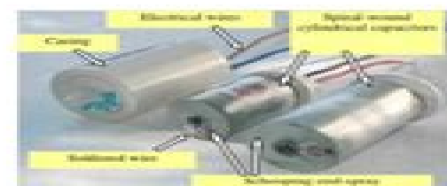
Fig. 2: Typical cylindrical low power MKP capacitors. The two removed from their cases are degraded through use.

The two spiral wound strips has metallization covering most but not all of their width. sprayed zinc particles which form a metallic cap on each end of the cylinder to which wires are later attached.