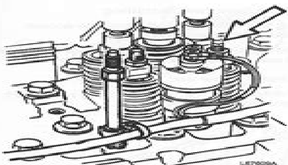
Fig. 147 Valve yoke adjusting screw

266 Adjust the valve yoke to zero clearance, so that it does not fit up against the valve stem.