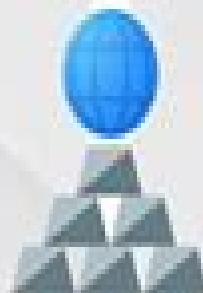
Domain Name System (DNS)