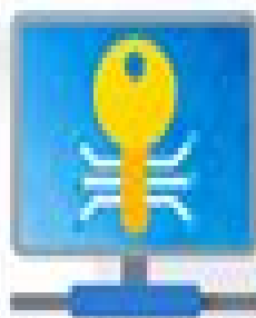
Transport Layer Security (TLS)