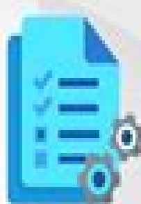
Group Policy Objects (GPOs)