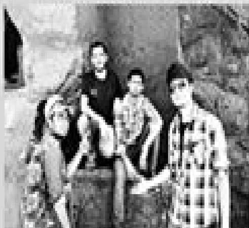
Histogram equalised image